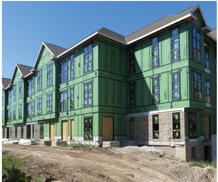
Summer/Fall/Winter 2022 White Oaks Apartments Totally New Building Under Construction