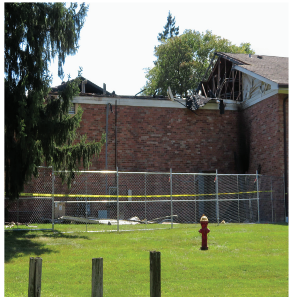
08/20/2022 River Place Apts., Brown Deer, WI. Lightning Strike and Ensuing Fire. 110 Units.