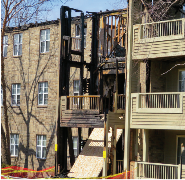
03/20/2019 White Oaks Apts., Bayside, WI. Fire Started on a Balcony. Cause Unknown. 62 Units Evacuated. Total Loss. Torn Down