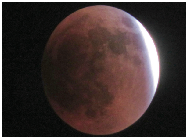
May 15-16, 2022 "Blood Moon" Seen From My Driveway.