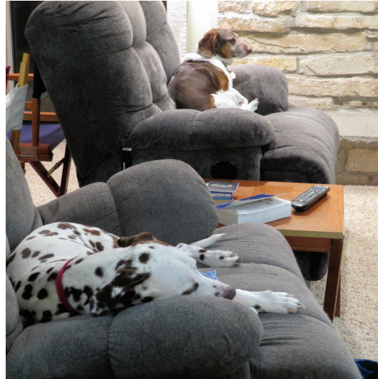
Rocket (front) and Winston (back) Best Friends Forever Relaxing