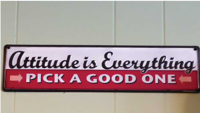
Superior advice decorating the dining area in Kurt Schulz's Deli & Pastry Shoppe. The food is scrumptious! The staff is cheerful! 8752 N. Deerwood Dr., Brown Deer, WI 53209. Check the website for open times and menus. https://kurtschulzdeli.com/