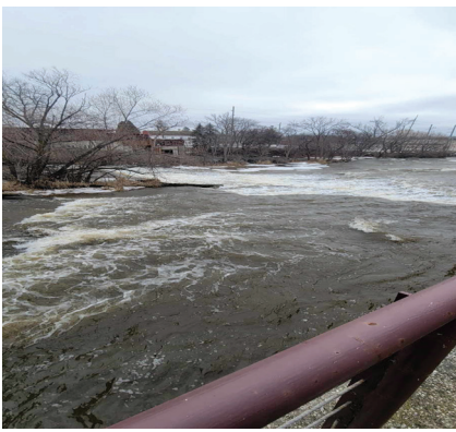
Rapids in Sheboygan Falls. The Sheboygan River is usually slow and peaceful. However, in early February it was a torrent