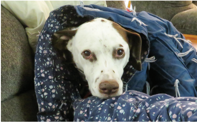
“Look into my eyes.” My Dalmatian, Rocket, has penetrating eye contact. When he visited the Vet as a puppy for the first time, the Vet said, “You have a confident dog.” Still true!