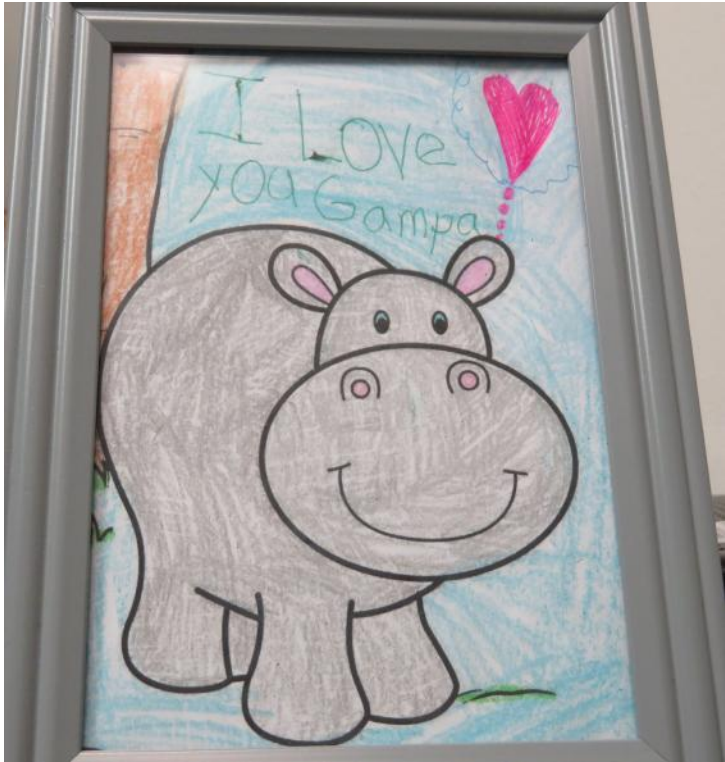
My seven year old granddaughter and I joke about hippos a lot. She lovingly colored this one now decorating Village Insurance.