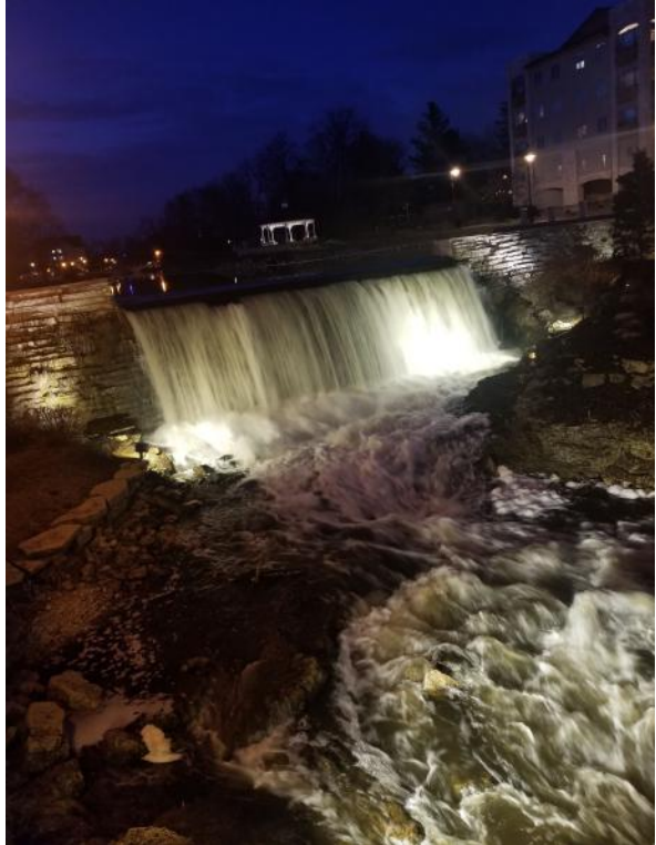
Menomonee River Mill Pond Falls February, Menomonee Falls, WI. Fun to observe when driving by.