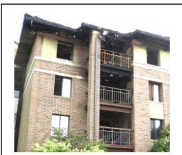
162 Units – 06/01/26 Fire. Glendale, WI

110 units. Lightning Strike, Fire and Smoke. Fortunately, none of my clients lived here.