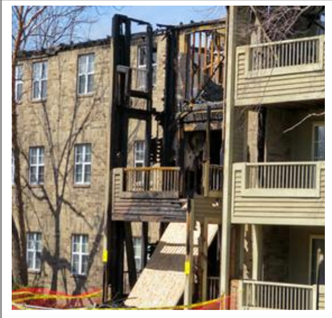
White Oaks Apts., Bayside, WI.