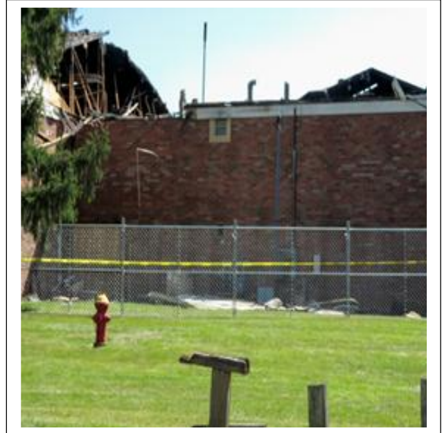
River Place Apts., Brown Deer, WI

Total loss. Torn down and rebuilt. A client lived in an adjacent building and was okay.